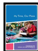
My Time, Our Place; Framework for School Age Care in Australia 2022 V2

Critical reflection: is a meaning-making process that assists informing future practice in ways that demonstrate an understanding of each child’s learning, development and wellbeing and implications for equity and social justice. It involves examining and analysing events, experiences and practices from a range of perspectives to inform future planning and decision-making ( Early Years Learning Framework 2022 V2 – refer to Sources ).