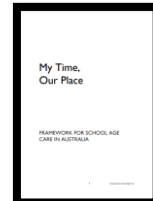
My Time, Our Place; Framework for School Age Care in Australia