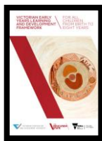
Victorian Early Years Learning and Development Framework

Approved learning framework: A document that outlines practices that educators and co-ordinators must use to support and promote children’s learning. The Early Years Learning Framework (Belonging, Being & Becoming), the Victorian Early Years Learning and Development Framework and My Time, Our Place; Framework for School Age Care in Australia are approved learning frameworks for use in Victoria ( refer to Sources ).